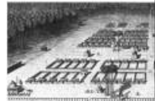
a sketch of Savannah