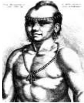
a drawing of a 17th century Virginia Native American